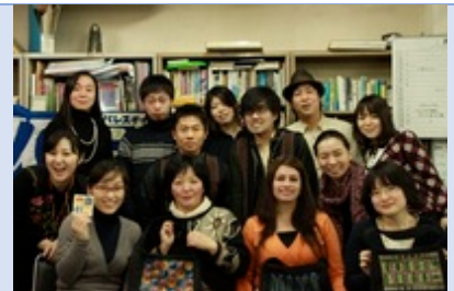
Members enjoy time with guests.