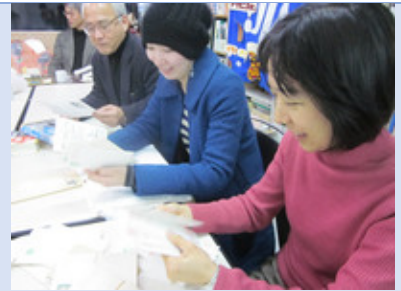
Post card collection.

Web site: http://www.ngo-jvc.net/vteam/laos/ Facebook: https://www.facebook.com/jvclaos Blog: http://laosvolunteerteam.blog.fc2.com/ Contact: Kimura (Laos project) E-Mail: kimura@ngo-jvc.net