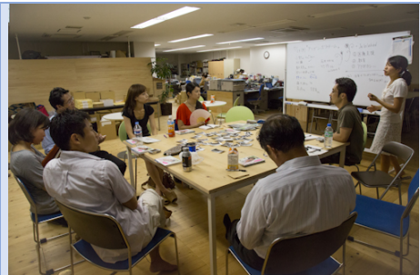
Event planning in action.