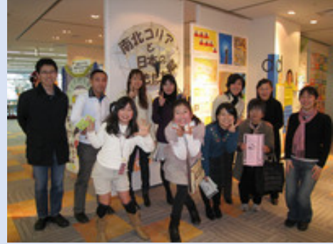
Members at the exhibition.