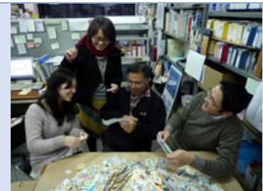
Our volunteer team sorting and cutting stamps.