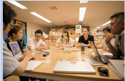
The team thinking about different ways to help.