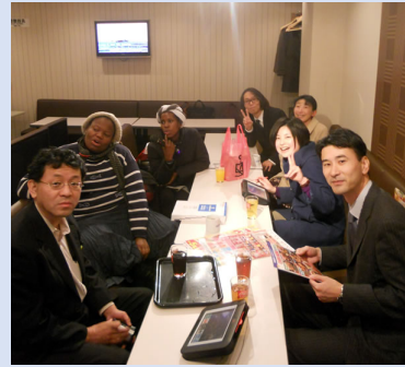
Japanese volunteers and South African guests enjoy karaoke.