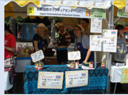
Selling Thai dishes at a charity event.